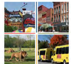
DELAWARE AREA CHAMBER OF COMMERCE 2016 Community Profile and Membership Directory

Copies are mailed to the membership and distributed throughout the year to Chamber walk-in traffic, new mover packets, staff recruitment packets requested by Chamber members and in many venues in the county. We encourage you to contact us for quantities of the publication to display and distribute in your lobby. The publication is also linked on the Chamber's website.