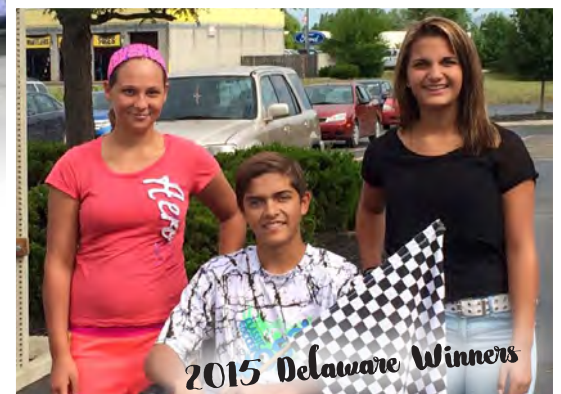
2015 Delaware Winners