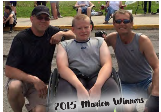
2015 Marion Winners